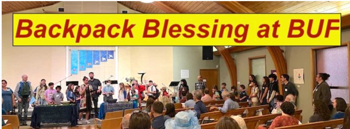
from September 7 Sunday Service